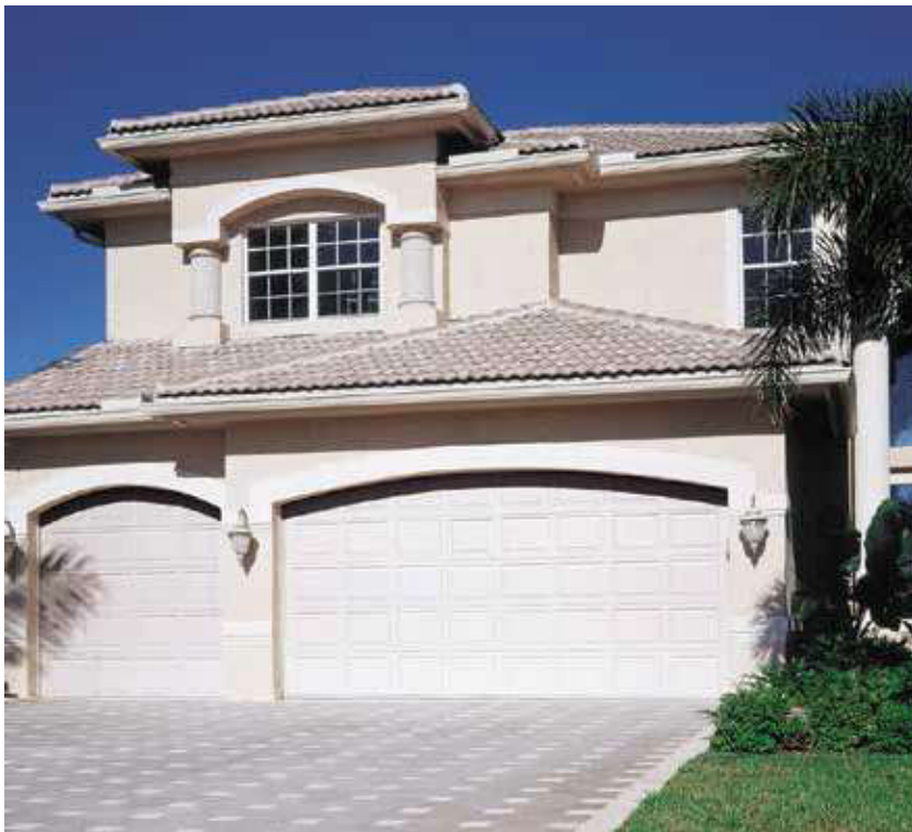
BuildMark™ - White Colonial