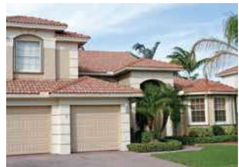
BuildMark™ - Almond Colonial