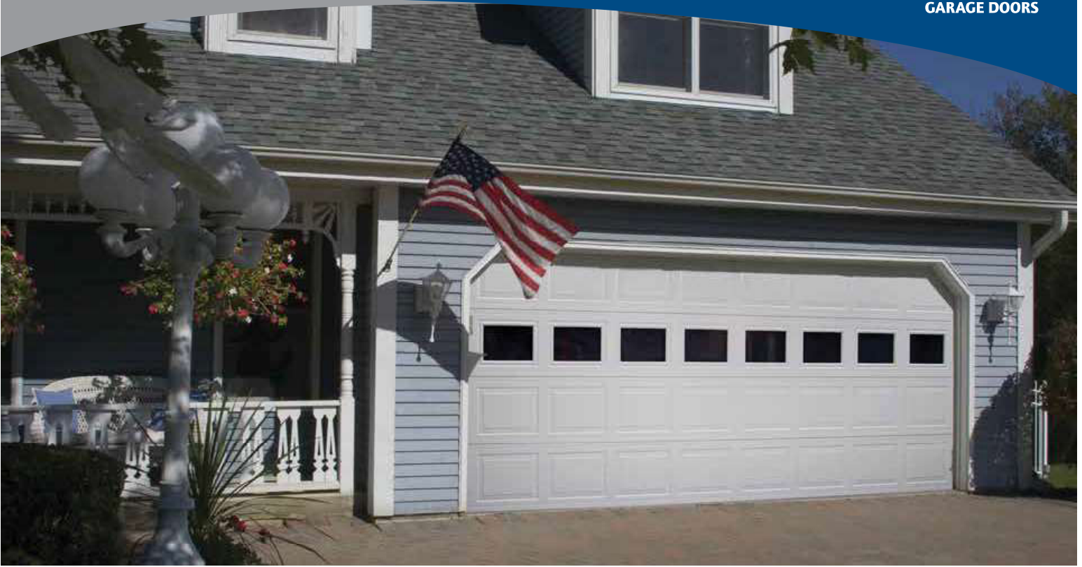
BuildMark™ - White Colonial with Colonial Windows