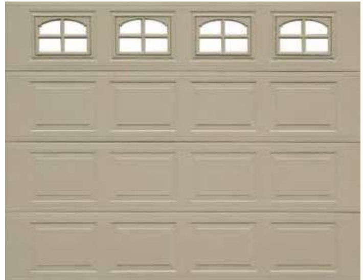
BuildMark, Colonial, with Cascade Colonial inserts

This steel garage door design offers a traditional look at an affordable price. Choose from the time-honored ranch and colonial patterns or customize your garage with a carriage house design. Optional polystyrene insulation can be added to provide additional comfort and help keep your garage quieter.