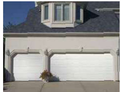
BuildMark™ - White Colonial